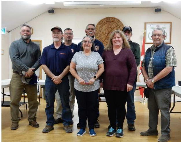
WOFGPA Executive 2022 - 2023