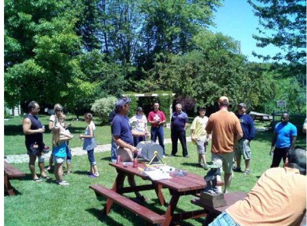
The anglers at award time.