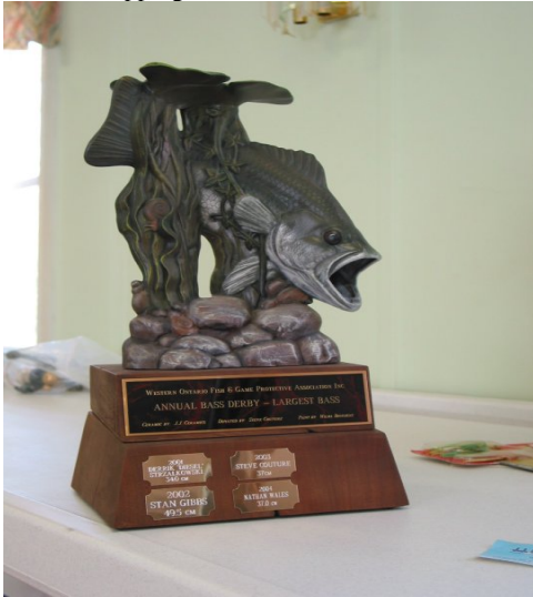
Largest Bass Trophy (photo taken July 2005)

Sunday, July 12 th turned out to be great sunny day to spend the morning angling for bass and then enjoying a burger with friends while swapping “fish tales”.