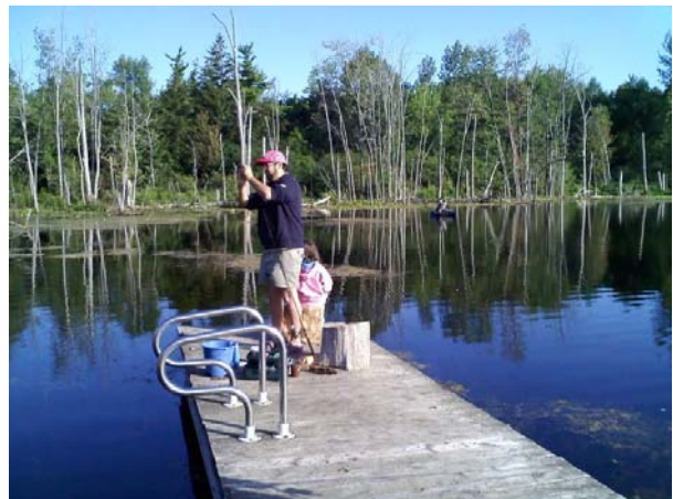
A father and his daughter share some time on the back dock.

The winner's names will be printed in the next newsletter. Thank you to all the volunteers for their assistance with this annual function.