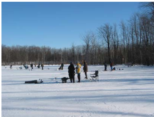
Club members enjoying cold weather angling