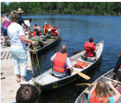
Lining up to start the Canoe Race.