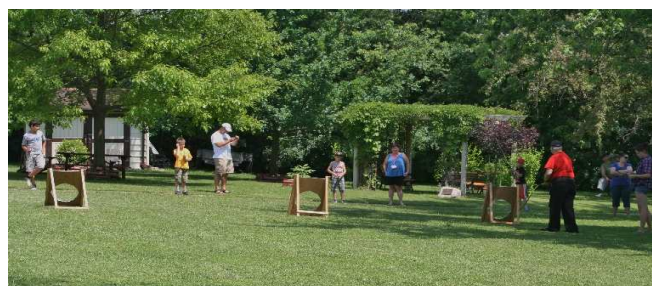
A group of youth learn to cast and hone their new-found skills (picture taken from archives)

So, if you are looking for a fun way to finish off the school year and start your summer vacation early then look no further. Bring out your children, grandchildren, neighbour's children to enjoy a day filled with a variety of activities and the wonderful environment of WOFGPA.