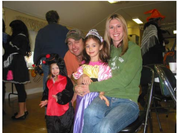
Halloween is truly a family affair