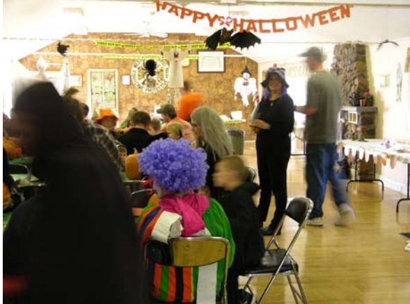
Welcome to the party – Come on in

Here are just a few photos from the afternoon’s festivities.