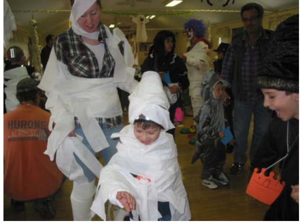
Becoming a mummy is tough work