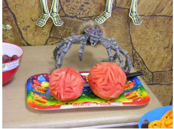
... And to think that the kids ate "Brain Food" and liked it.