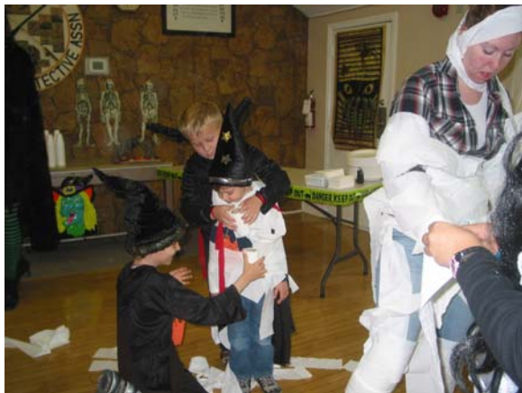
Mummy making takes lot of practice