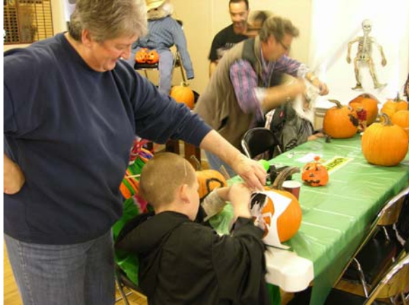
Pumpkin artists needs help now and then holding their pumpkin at just the right angle