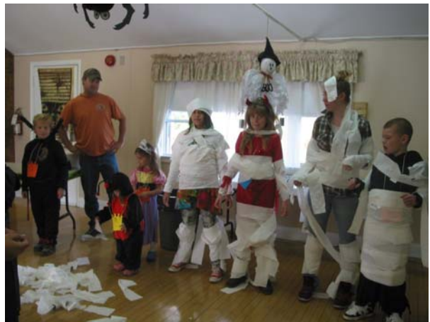
A lot of mummies at WOFGPA