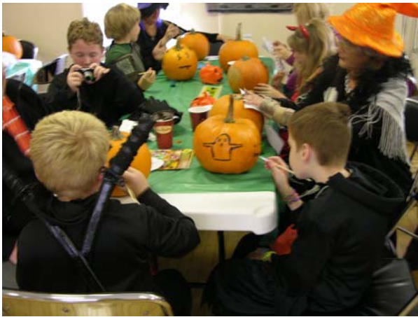
Such an effort went in to painting their pumpkin just right