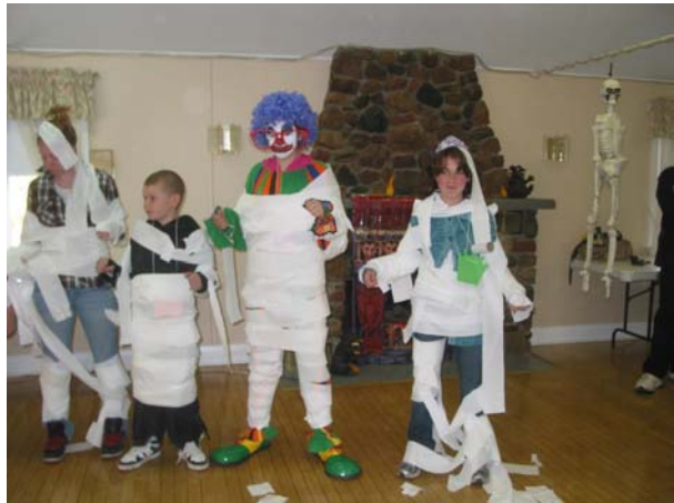
Even more mummies